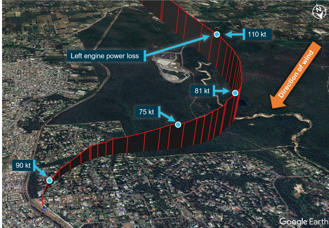
Figure 1: Flight profile showing recorded groundspeed