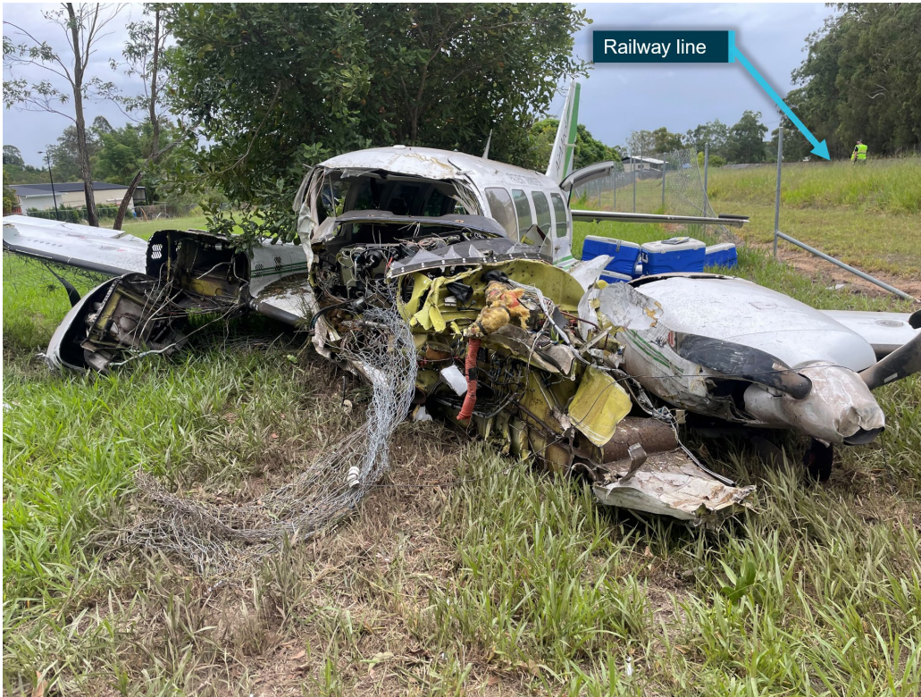
Figure 2: Accident site