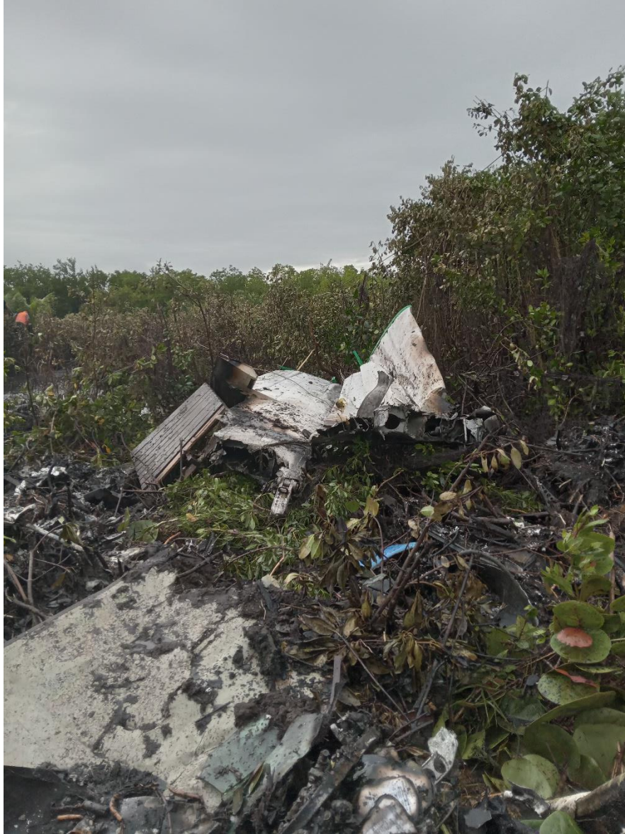
APPENDIX E- WINGS