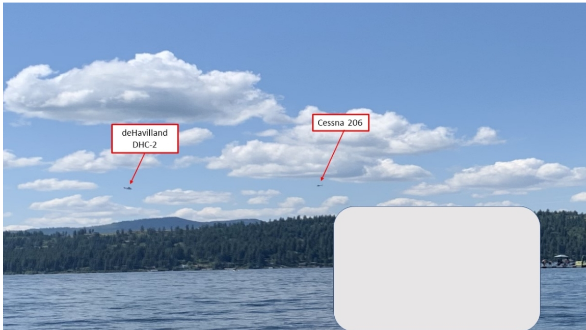
Figure 1. Still image from live capture of the Cessna and De Havilland airplanes before the collision.