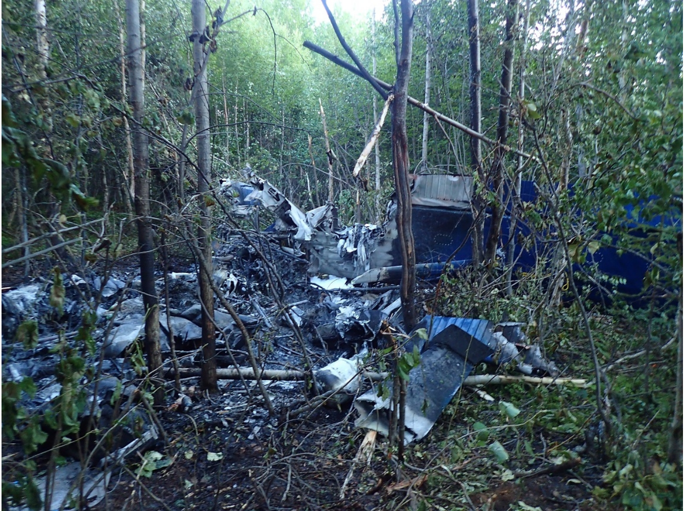
Figure 2. Accident airplane at the accident scene.

The wreckage consisted primarily of the wings, forward fuselage frame, floor structure and engine with propeller attached. The wreckage exhibited either soot, charring, oxidized metal, or melted aluminum. Hardened masonry mortar was intermixed with the airframe and engine components. The right wing was mostly intact with some fore-to-aft buckling on the outboard leading edge and the flap and aileron were attached. The left wing had significant leading edge buckling near the outer edge. The left flap and aileron were attached, but the flap control rod was disconnected at the C clamp. The left aileron inboard edge had impact damage that matched the adjacent flap edge damage with the flaps extended about 30°, which indicated the flaps were likely at or near the takeoff position at the time of impact.