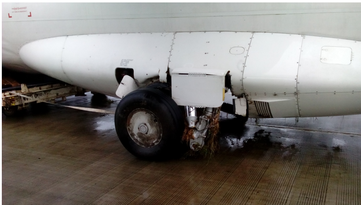
Figure 3 Broken R/H main landing gear