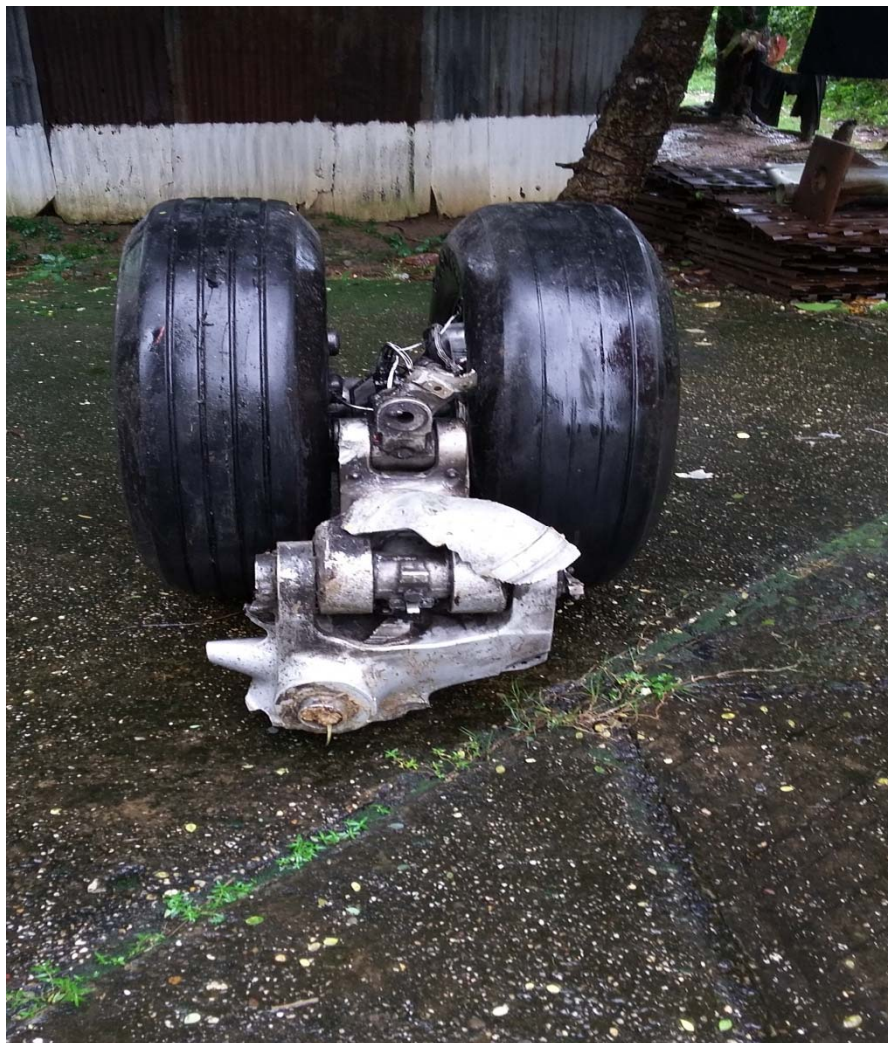
Figure 2 Broken L/H main landing gear