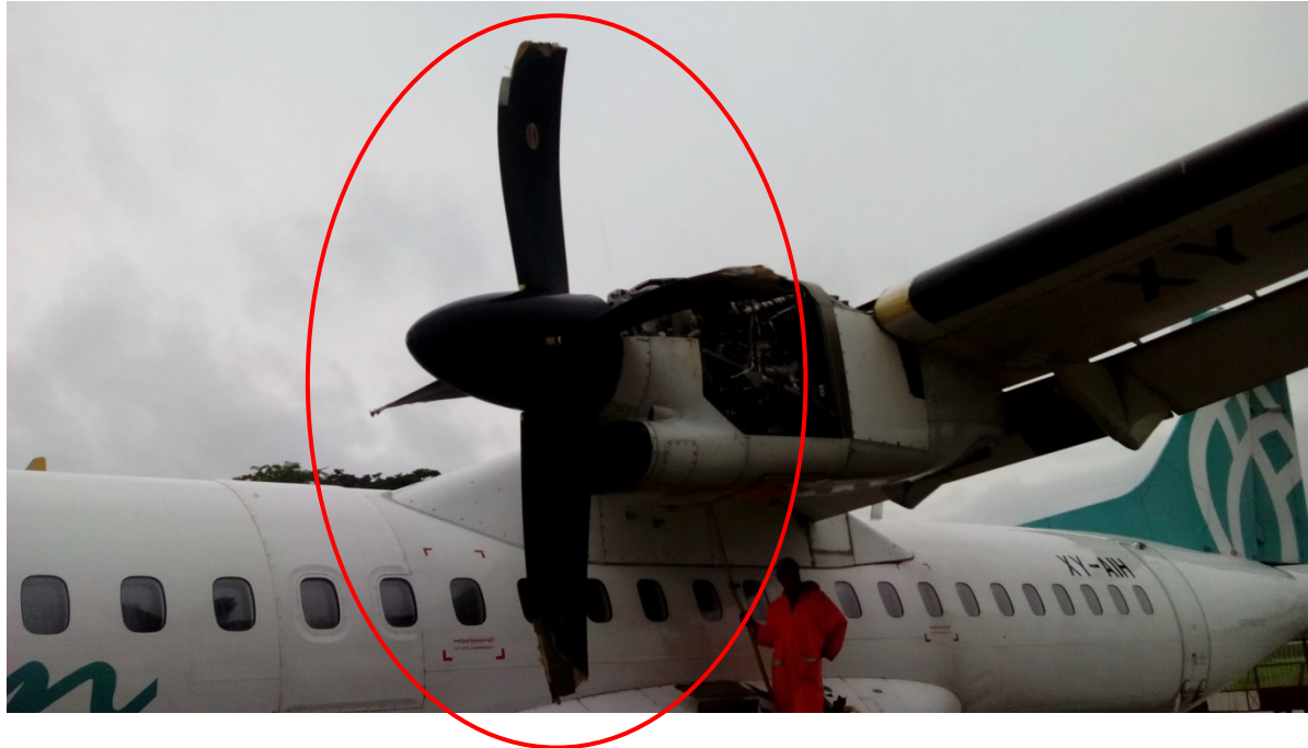
Figure 6 Broken propeller's blades