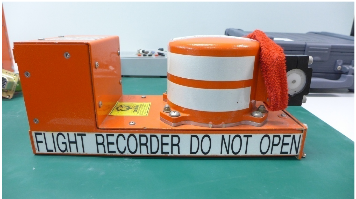
Figure 7 Flight Data Recorder