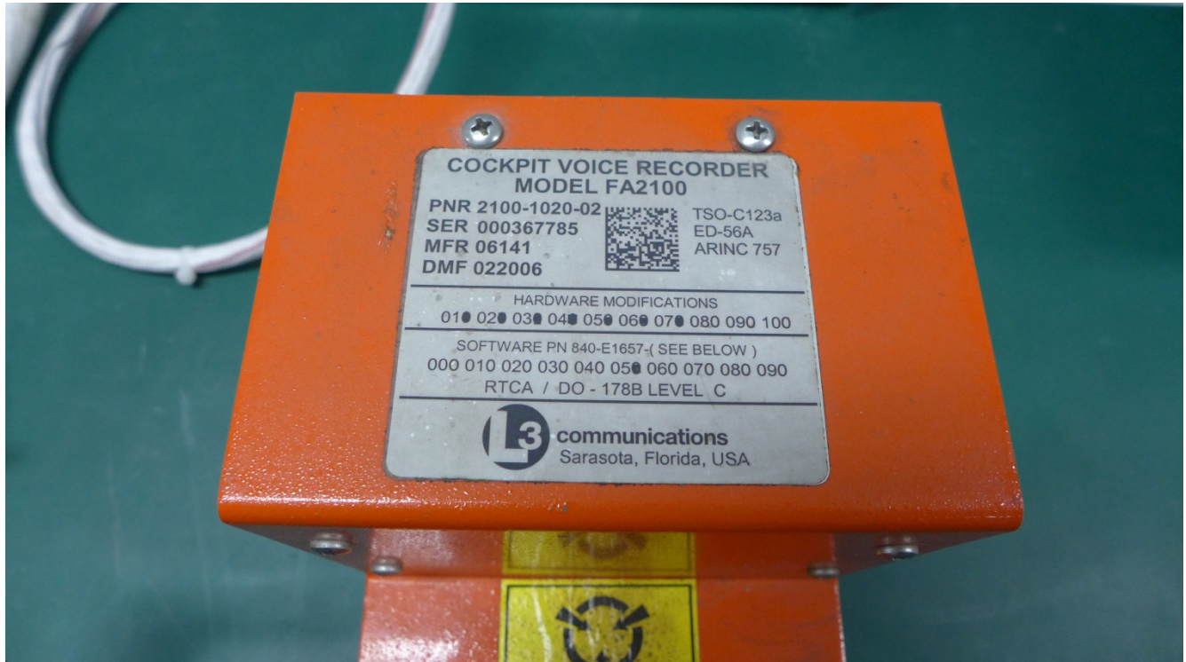
Figure 8 Cockpit Voice Recorder

The 2-hour cockpit voice was FA 2100, PNR 2100-2010-02, SER 000367785.