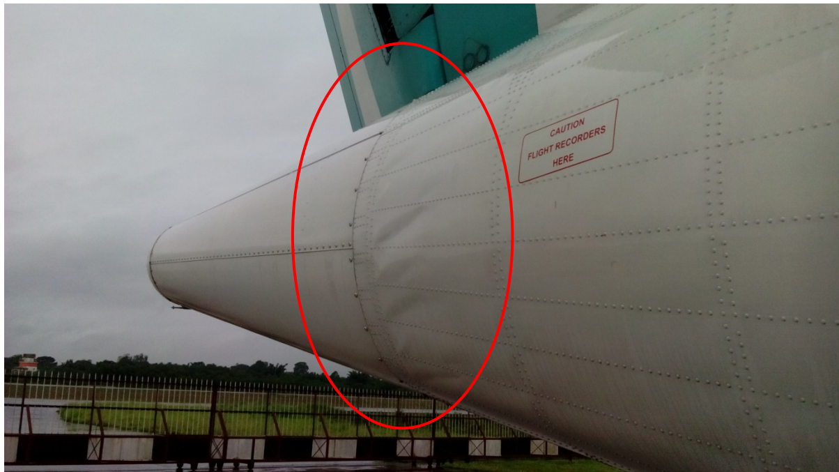
Figure 5 Wrinkled and deformed fuselage skin