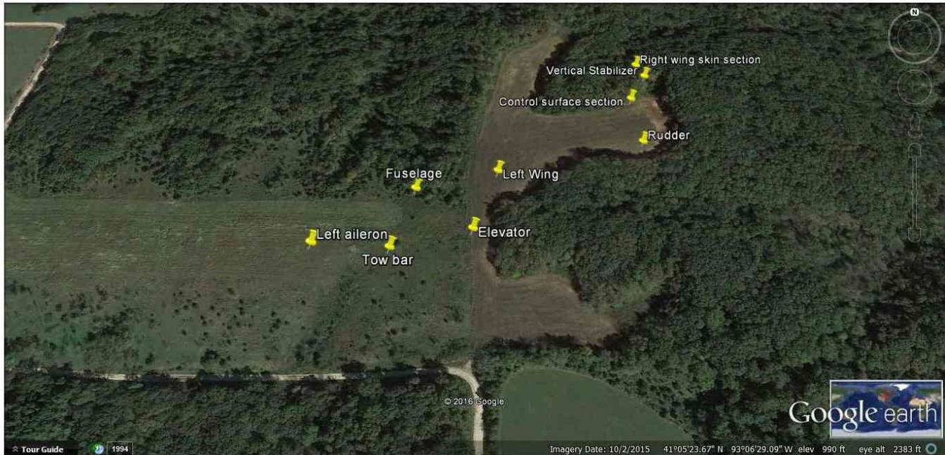
Figure 3. Wreckage Distribution

The fuselage came to rest on a 300° heading. The fuselage was found mostly crushed with numerous skin separations.