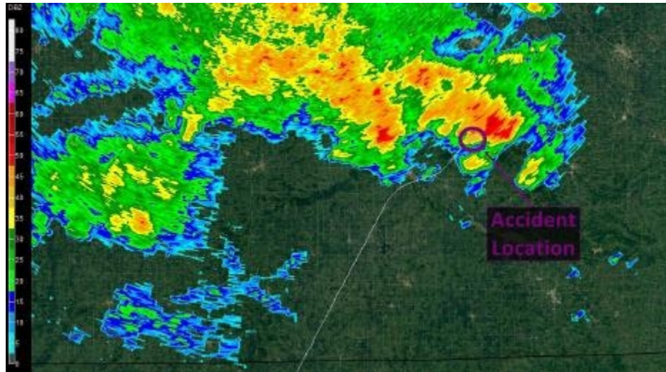
Figure 2. Level-II reflectivity product from a sweep initiated at 1223:06 CDT. Accident flight path through the accident time denoted by white line with accident location marked.

Given the pilot's discussions with ATC during the flight, the pilot was aware of and was trying to avoid convective weather along his route of flight. The airplane most likely would have encountered instrument meteorological conditions (IMC) during the last several minutes of flight. Figure 2 shows the airplane's flight path into storms. Additional details can be found in the weather study in the docket.