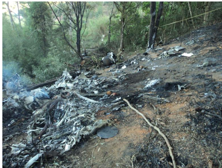
Figure 2 – Aspect of the wreckage.

The final impact occurred 50ft below the level of the runway 03, with the trajectory of the aircraft aligned with the runway axis.