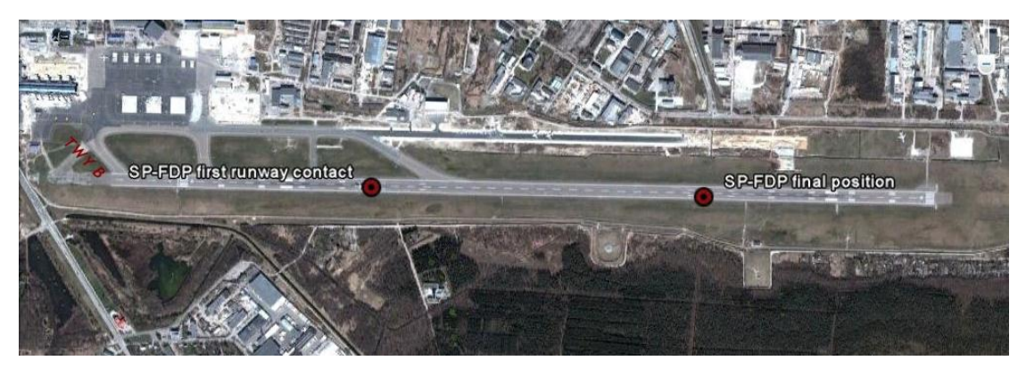
EETN runway with indicated aircraft position

According to PF statement the " Gear Up !" is commanded on the altitude 50 m. No " Positive Climb " callout was made. The PF did not recall hearing the V<sub>r</sub> callout before rotation and stated, that he rotated the aircraft "at V<sub>r</sub> or maybe a bit earlier".