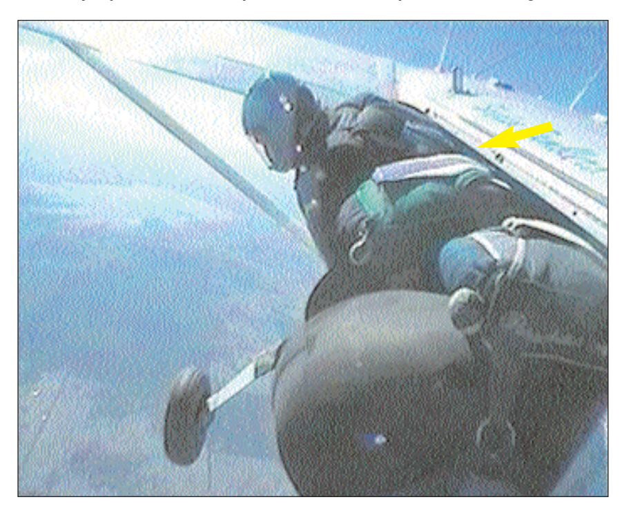
Accident jump - exit readiness position with reserve parachute cover against door frame