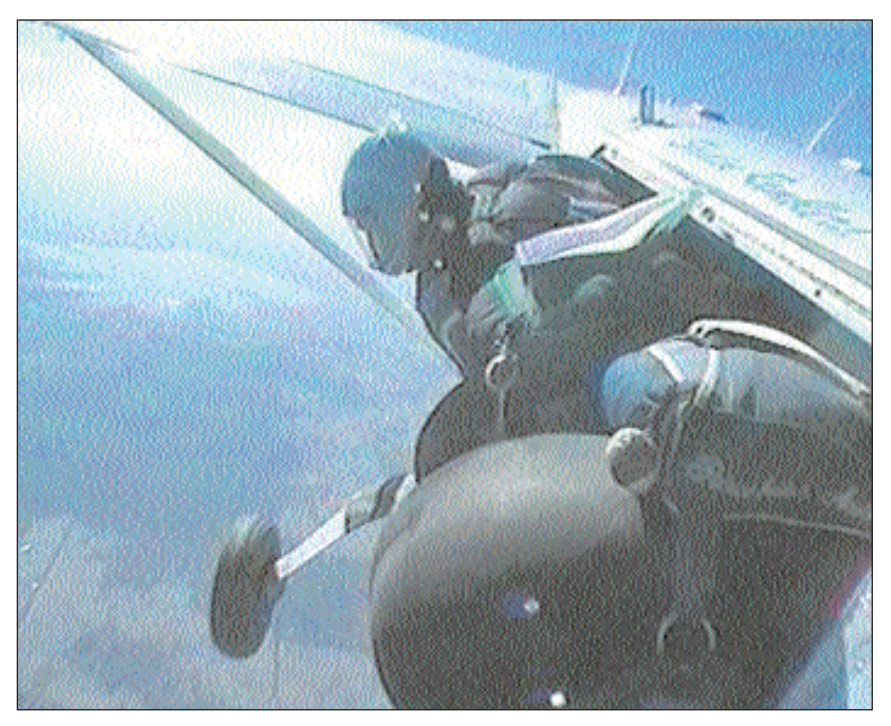
FIGURE 7: Accident jump – ejector spring deploys pilot chute of reserve parachute