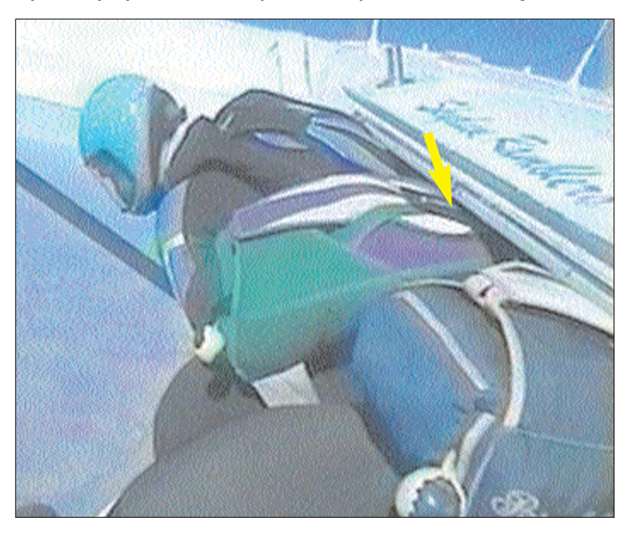
FIGURE 3: A previous jump – loose release mechanism panel on exit

A previous jump - exit readiness position with parachute container against door