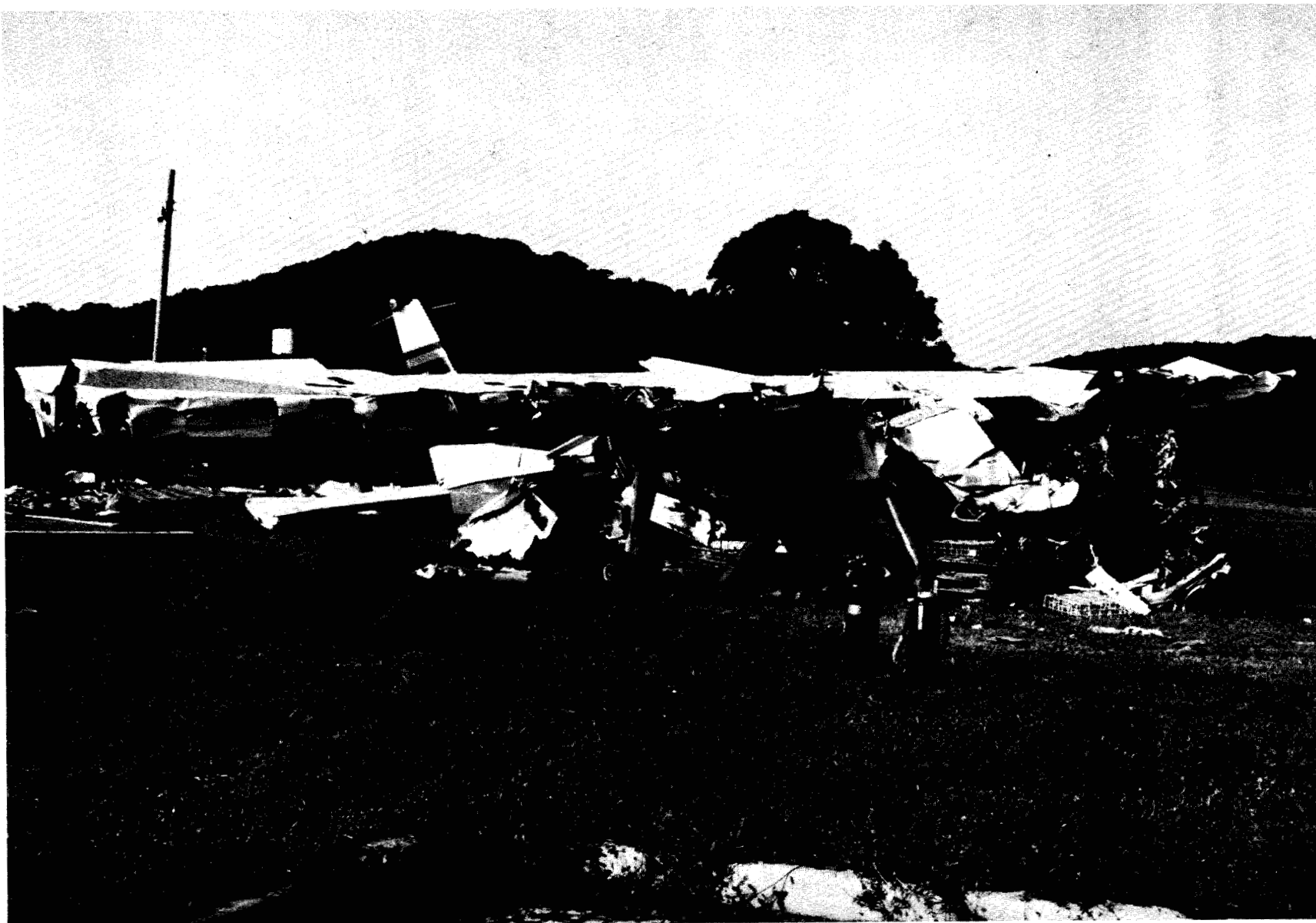
Figure 2.--Britten-Norman BN-2A-6 Islander N589A.