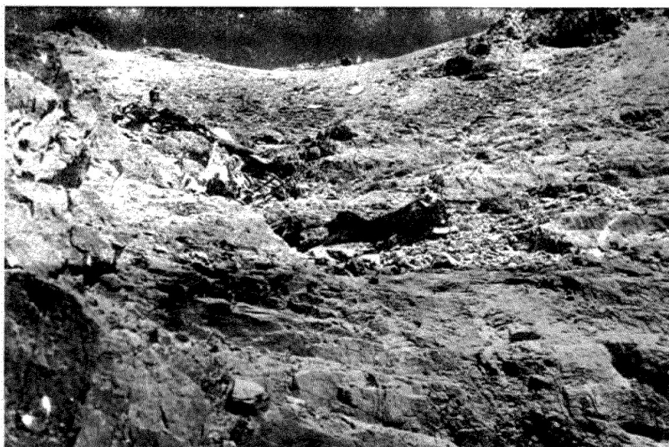
Wreckage fell down steep slope on other side of ridge